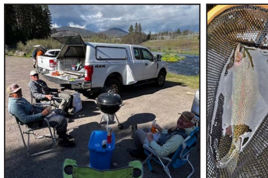
Checkin' on the ribs!