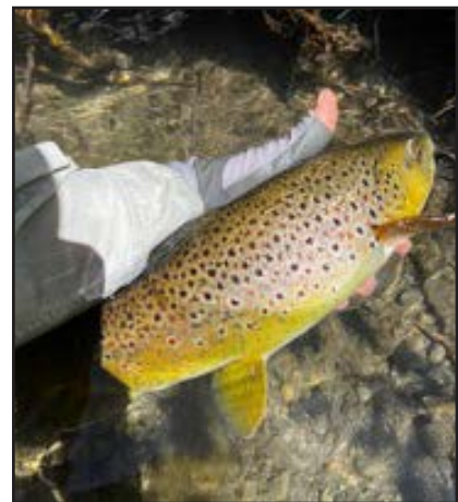
Eric See's nice brown.

Sunday arrived. The nighttime temperatures were probably ten degrees warmer than the previous night. A big breakfast scramble was put together with leftovers from the previous dinner. We decided to go back to Powerhouse #2. A beautiful day! All caught fish, well, except for John. We noticed several dead trout of good size in the creek. Everyone had some kind of speculation as to why there were eight to ten dead trout. Did fly rodders from the previous day use tackle too light and exhaust the fish? Was there some fish disease killing them? Did the electromagnetic radiation from the overhead powerlines have anything to do with this? Alien abduction? Eric See examined a couple of the trout closely and noticed they were badly beaten up. His theory, and certainly the most plausible one, was that they came from Baum Lake and went through the turbines. Hard to survive that little adventure... Big Matt was the first to leave with a four-hour drive home, then a plane to catch the next morning. Then Eric Hoska headed back to Chico looking forward to another outing. Eric See and Matt left for home looking forward to another week of work. John lingered. He headed back to camp for one more night. Enjoyed the campfire, a cigar, and some contemplative solitude. Monday morning, he was composing this narrative from Site 5 of the McAurthur- Burney Falls Campground.